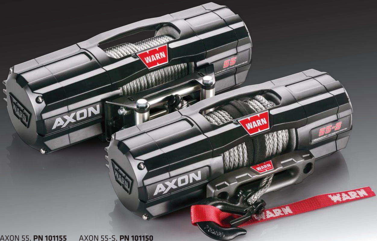
AXON 55, PN 101155 AXON 55-S, PN 101150