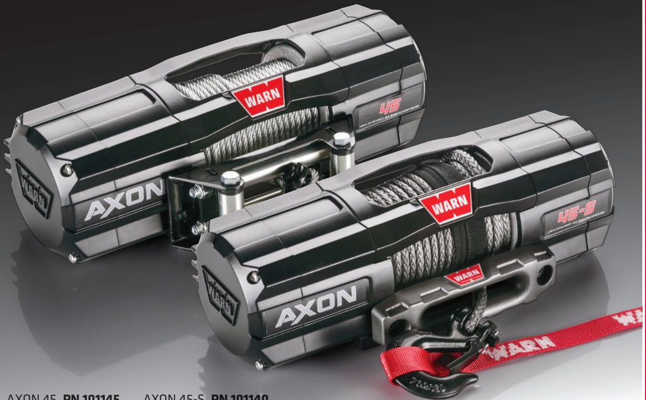
AXON 45, PN 101145 AXON 45-S, PN 101140