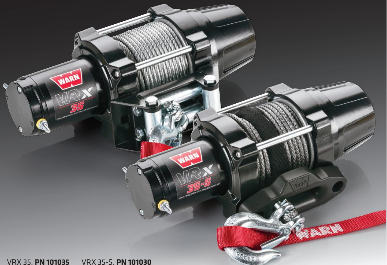
VRX 35, PN 101035 VRX 35-S, PN 101030